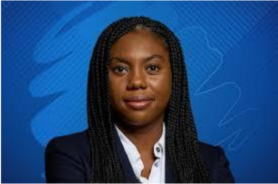
Kemi Badenoch (Conservatives)