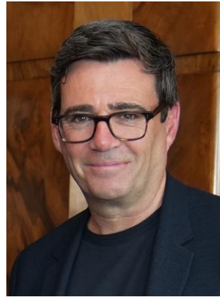
Andy Burnham (TBC) (Labour)