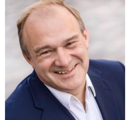
Ed Davey (Liberal Democrats)