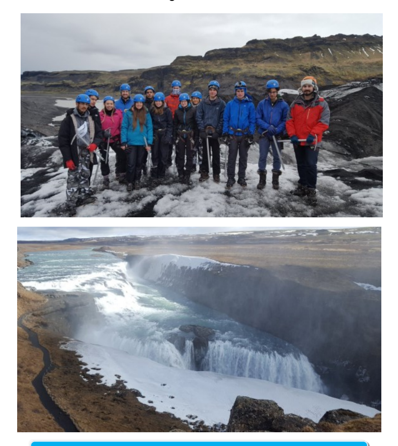
ICELAND TRIP PHOTO GALLERY

Many students (and staff) found it very hard to leave the UK on the Sunday to leave for Iceland, especially with the weather being forecast to 23 degrees and sun! However, after a flight over amazing scenery, we arrived in Iceland where, despite the 22 degree drop in temperature, we were all extremely excited by the forthcoming days of exploration. With 5 staff and 41 students travelling around airports, hotels and landmarks, we managed to pack in a lot during our few days in the land of ice and fire. This included a chance for the students to stand between two tectonic plates at the Bridge between Continents, walking with Eurasian plate on the left and North American on the right. To make it extra special it started to snow there too. In the next few days we also saw the Black Sand Beach on the south shore with its giant basalt columns and experienced some bitterly cold winds. A highlight for all was the chance for us to go walking on Sólheimajökull Glacier, kitted out with crampons, ice picks and helmets. We even had a chance to visit some of the huge picture-postcard waterfalls and walk behind them (whilst getting soaked!). Before we left Iceland, we went to Thingvillier National Park and saw the infamous geyser park. We packed lots of activities in to our visit, and it therefore it made perfect sense to enjoy a dip in the geothermally heated secret lagoon and relax a little a little before coming home.