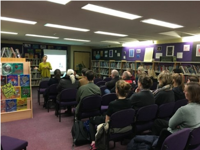
Fundraising Information evening