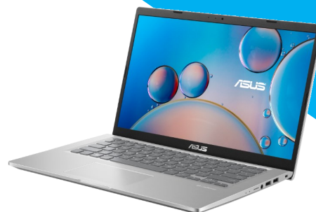
ASUS VIVOBOK 14 (MODEL P1404ZA-NKI385XA)