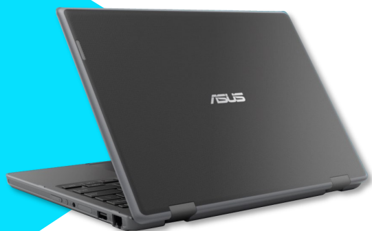
ASUS BR1100 (MODEL BR1100C-C41XAS-3Y)