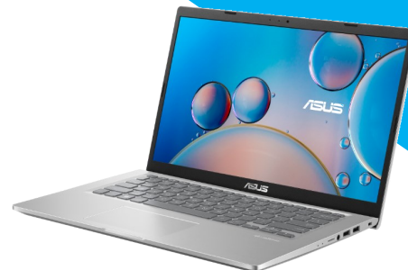
ASUS VIVOBOK 14 (MODEL P1404ZA-NKI385XA)