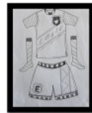
2 nd : Ruby Parkman-Mills