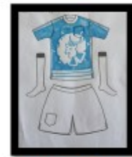
4 th : Grace Copping