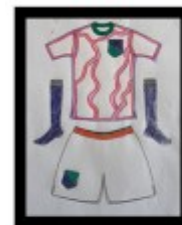
7 th : Libby Wetherall