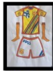
1 st : Mya Birk