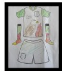
6 th : Magnus Warren