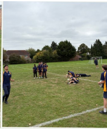
Outside on the rugby pitch...