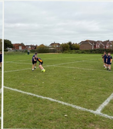
...in the Noughts and Crosses challenge...