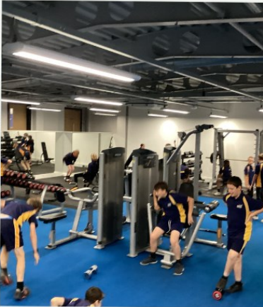
and in Morning Fitness Club...