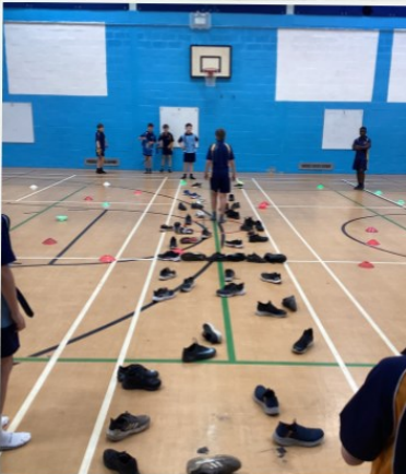
with collaborative work in rugby, OAA and stretch and challenge!