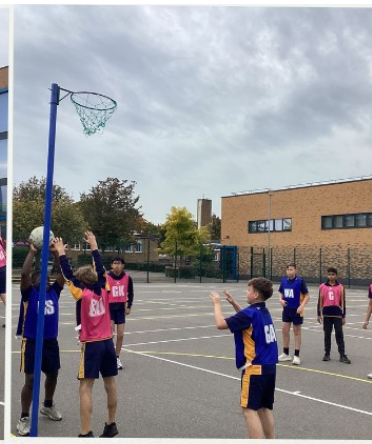
Great work in Year 8 netball...