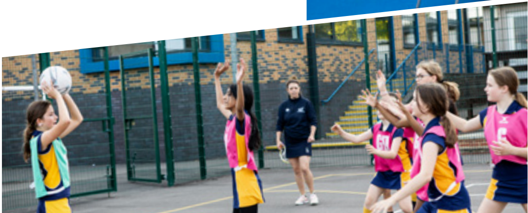
COLLABORATION IS ONE OF OUR CORE VALUES, EVIDENT IN LESSONS, ACTIVITIES & THE MANY SPORTS IN WHICH STUDENTS CAN REPRESENT THE SCHOOL.

Our great facilities include: a purpose-built Maths block, state of the art Drama theatre and adjoining rehearsal studio, professional standard, floodlit Astroturf, three new, floodlit tennis / netball courts, and our enviable Furze Platt Leisure Centre, Sixth Form and the Music department with professional-standard recording studio. In recent years we have added a new English department along with state-of-the-art Science laboratories and a new Theatre which stages performances and events for audience of over four hundred.