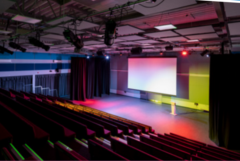
OUR 400 SEAT THEATRE IS A FANTASTIC ASSET FOR THE SCHOOL AND OUR COMMUNITY.