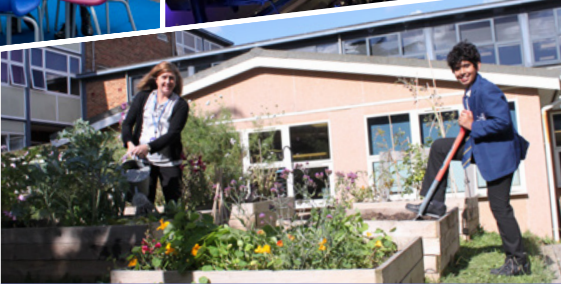
STUDENTS AND STAFF FORGE RELATIONSHIPS THROUGH PARTICIPATING IN A RANGE OF ACTIVITIES.