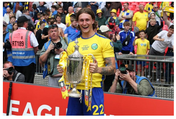
Well done to him and we wish him the best of luck for the future.