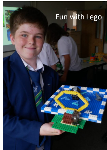
Fun with Lego