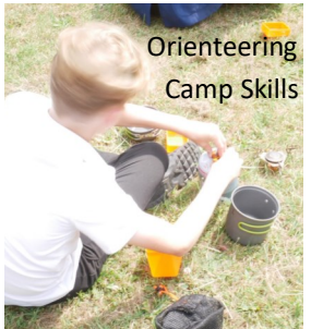
Orienteering Camp Skills