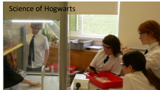
Science of Hogwarts