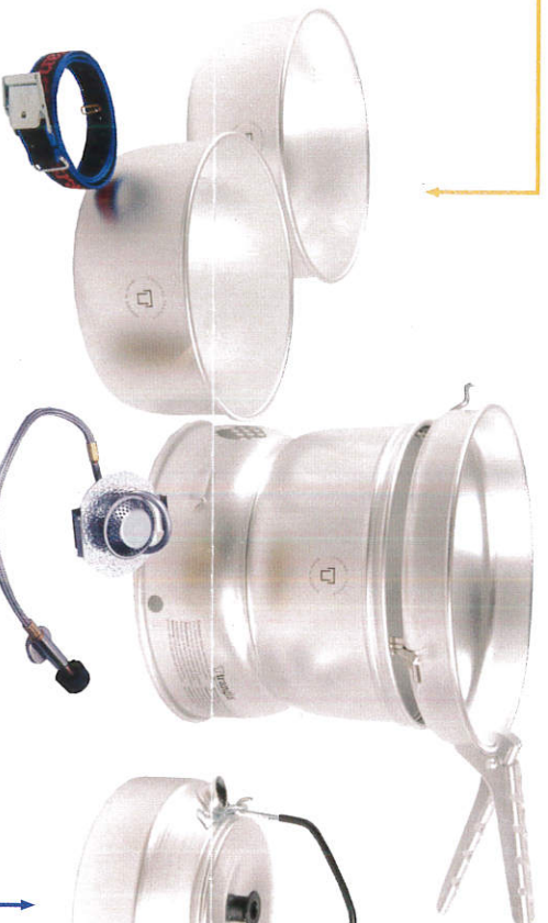
Trangia 25-1UL Stove