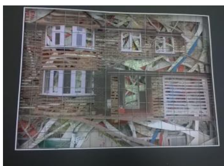
By Abigail Wilcock