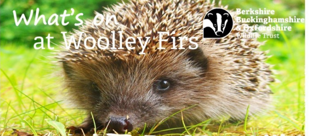
Wildlife Club for Teenagers in Maidenhead

Be a Wildlife Warrior and explore, discover and protect our amazing reserve! We are running a monthly wildlife club for teenagers up to 17 years old.