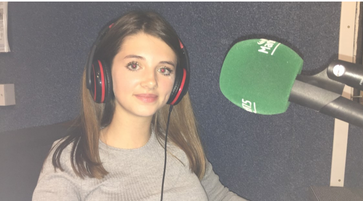
More of our Year 9 DofE students continued with their TV work, practising reading from an autocue and also co-presenting in pairs.