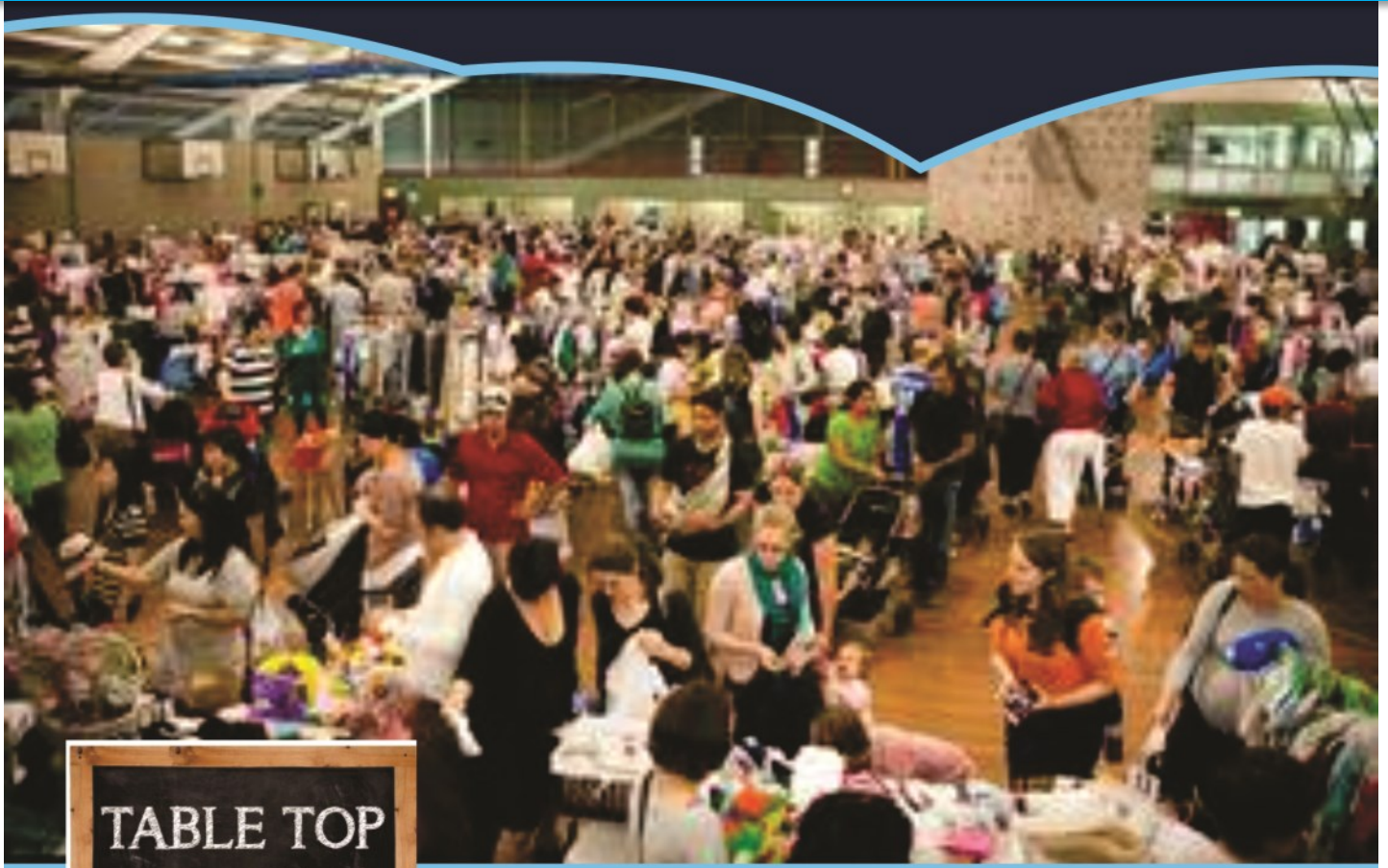
TABLE TOP SALE