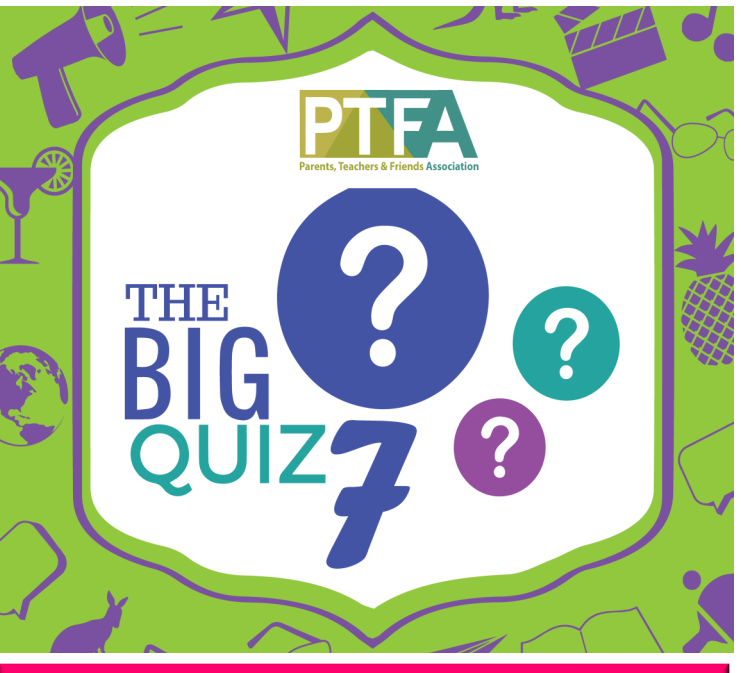
THE BIG QUIZ - BOOK TICKETS

information. We always welcome raffle prizes to make the evening even more fun and to raise even more money for our school. We would welcome good quality unused gifts, alcohol or services such as cake baking, photography etc. Please email jeff@iifa.co.uk if you can help.