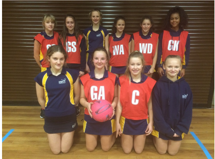
Red team beat Windsor Girls A.

Year 9 girls played in the RBWM netball tournament last night. All girls played excellently in 6 matches.