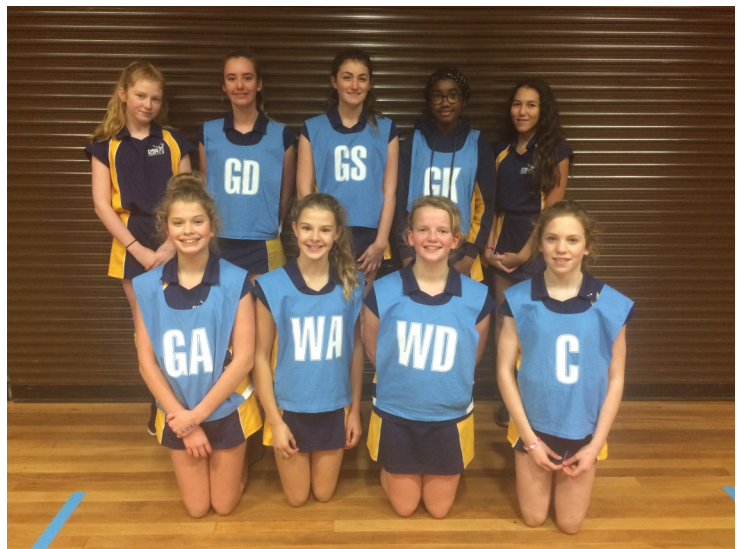
Blue team beat Claires Court B and Windsor Girls B