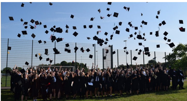
YEAR 11 GRADUATION PHOTOS

Thank you and farewell to our wonderful Year 11 students, who have had a memorable week with both their Graduation Ceremony and the Prom. Despite the Graduation being held on an extremely hot afternoon, we were very proud of all our students who have achieved so much in their years with us. It is also lovely to report that many happy parents praised the event afterwards. The Prom, held at Windsor Racecourse, was a hugely enjoyable evening and our students looked fantastic.