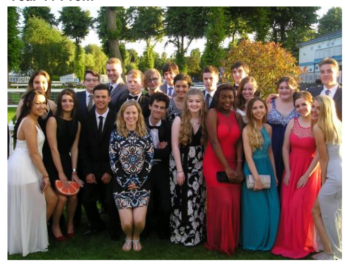
Year 13 Prom